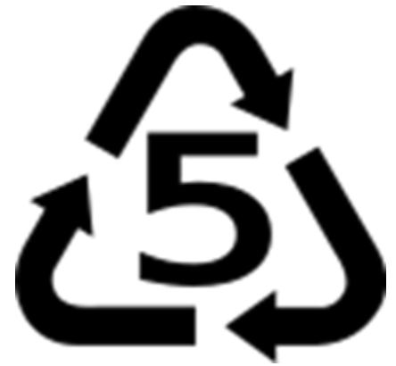
Plastic Resin Identification Code for Polypropylene