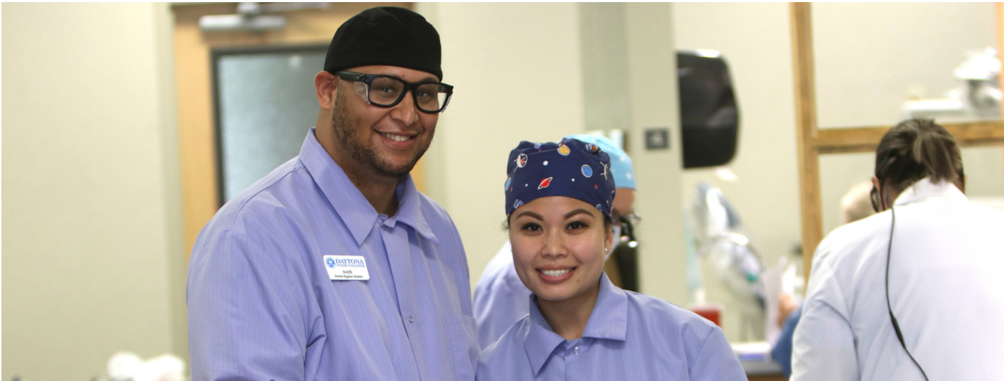
The Dental Hygiene Clinic is located on the DeLand Campus, Bert Fish Hall (Bldg. 6A), Rm. 100